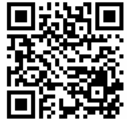
Survey QR Code