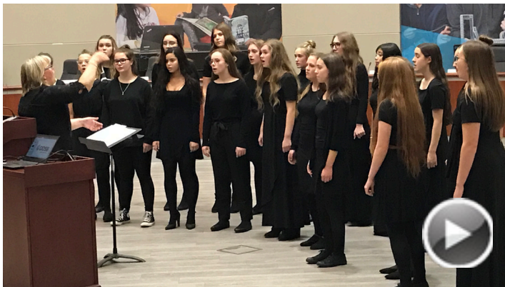
Students from Port Perry HS perform O Canada, Frobisher Bay, and Imagine for audience members and Trustees.