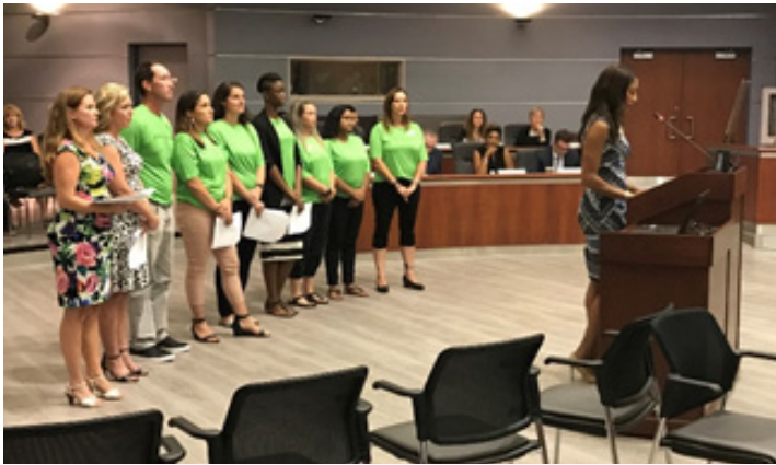
Transitioning Planning: Choosing My Success, Refining My Pathway and Designing My Future team present their initiative to the Board of Trustees.

In 2017–2018, the team continued efforts to increase equitable outcomes for all with a Choosing My Success system-wide response to ensure that all students transitioning to Grade 9 throughout our district make careful and evidence-informed pathway choices. A continued and enhanced transition focus for Grade 7 to Grade 12 students will be implemented to promote a pathway plan that ensures all students have the opportunity to see their future program as viable and select educational goals that align with their goals for the future.